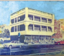
Dange Shopping Centre