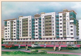
Dange Complex - Tower I