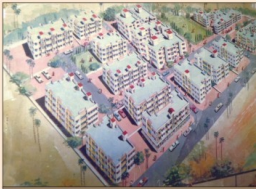
S. K. & Associates