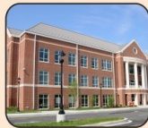
School / College