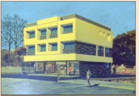
Supreme Shopping Centre