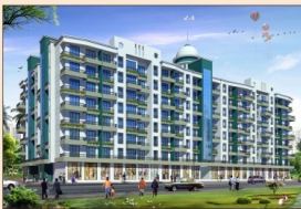
Dange Complex - Tower II