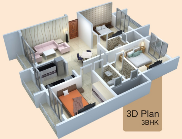
3D Plan 3BHK